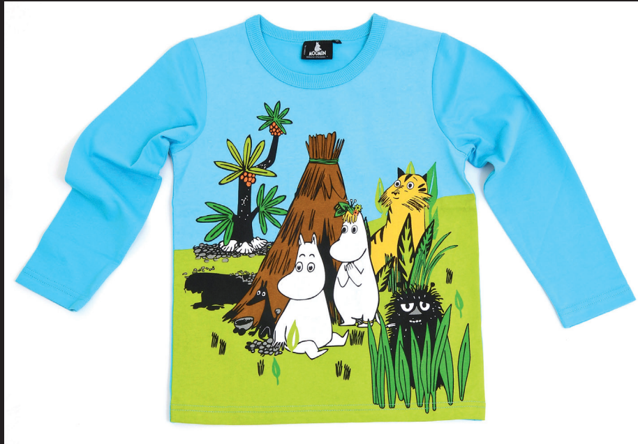
companyname boys long sleeve jungle.jpg